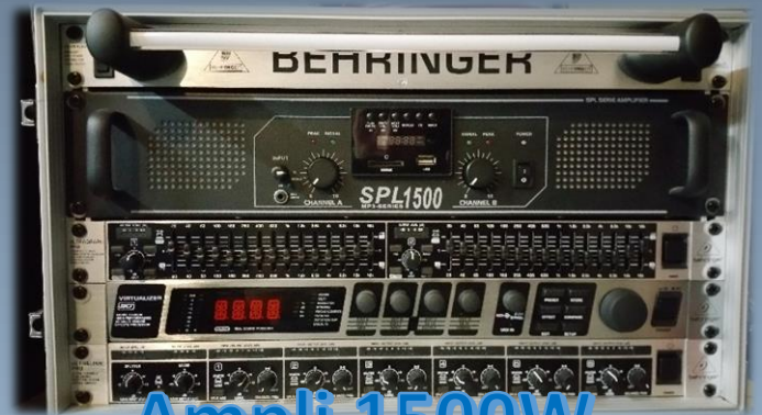
Ampli 1500W Equalizer Générateur d'effets