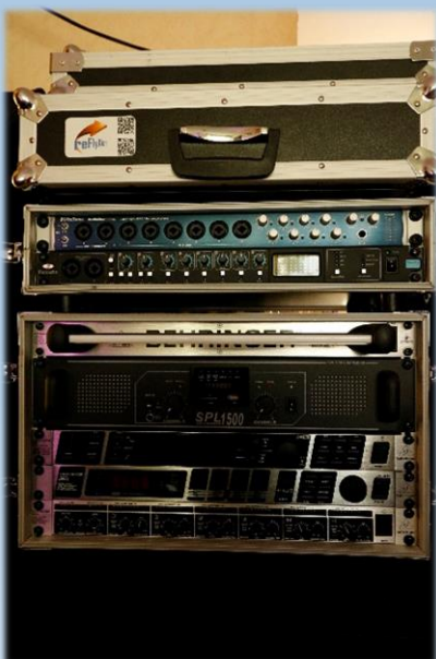
Acquisition 16 voies numériques PreSonus AudioBox 1818VSV Focusrite OctoPre MkII Logiciel Studio One 3