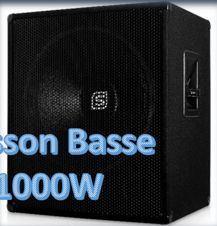
Caisson Basse 1000W