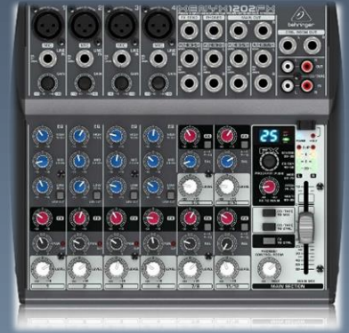
Xenyx 1202 Fx